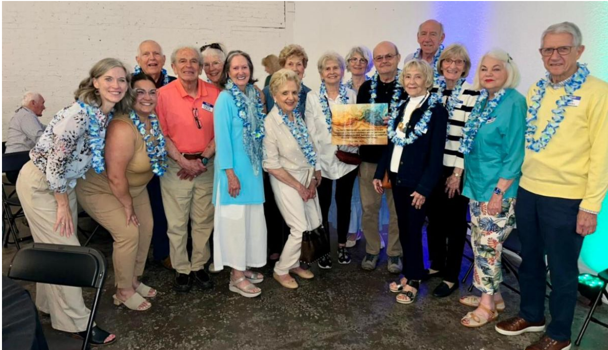
Resident volunteers, Deerfield Charitable Foundation Board and Staff members celebrate with Meals on Wheels at the May 28th reception.