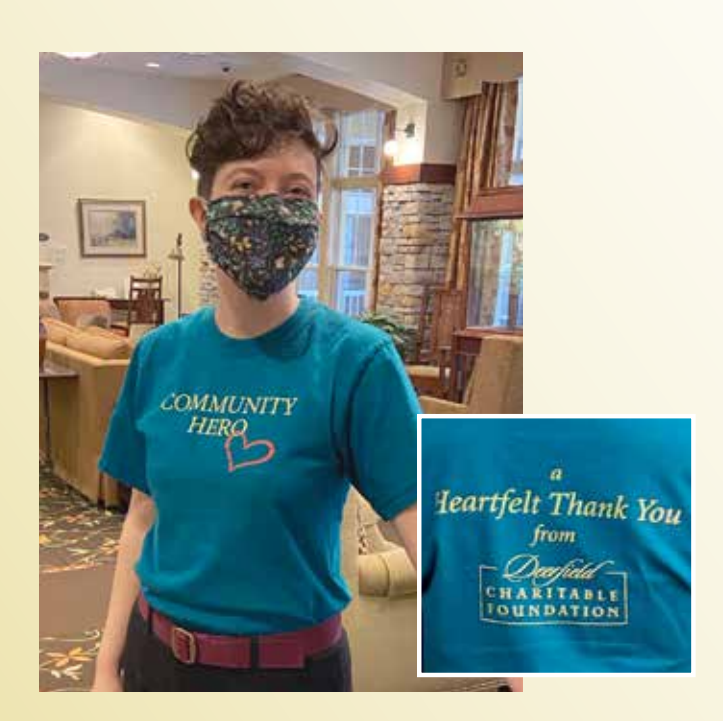
Employee appreciation t-shirts were provided by the Foundation to all of Deerfield's staff in 2020